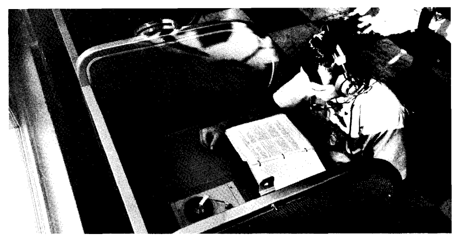
Special language laboratories, equipped with tape recordings and earphones aid in the learning of foreign languages.