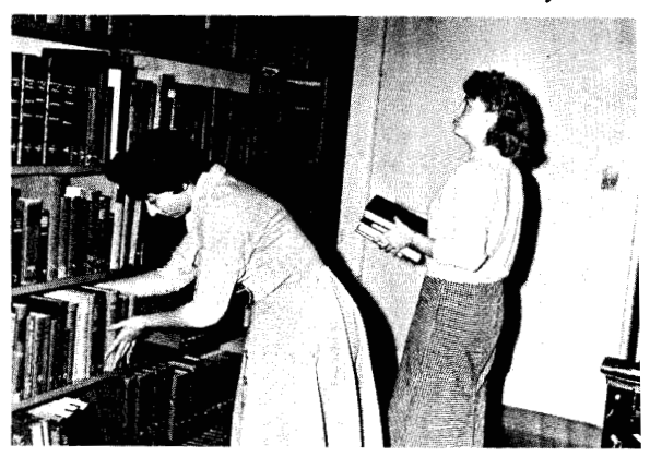
Our library science class maintains order by cataloguing, repairing and shelving new and returned books.

FIVE THOUSAND copies of printed as you read these words. you a